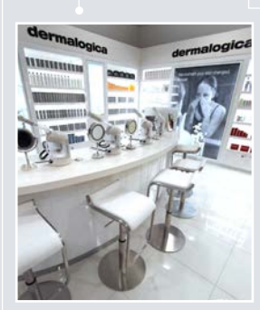
Dermalogica launches in Australia