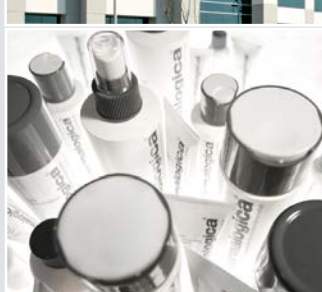
Dermalogica is founded