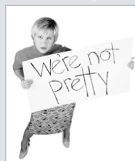
Trade advertising campaign in support of professional skin therapists launches