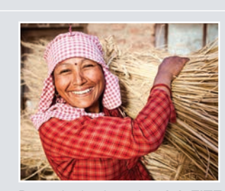
Dermalogica launches joinFITE (Financial Independence Through Entrepreneurship), the initative to help 25,000 women entrepreneurs start or grow a business