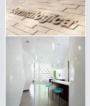
Dermalogica on Montana opens in Santa Monica