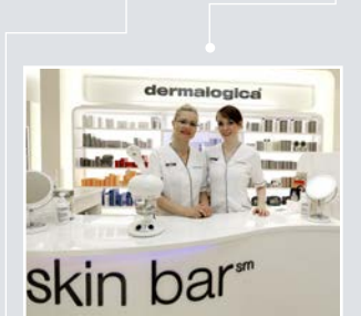
Dermalogica launches in Germany